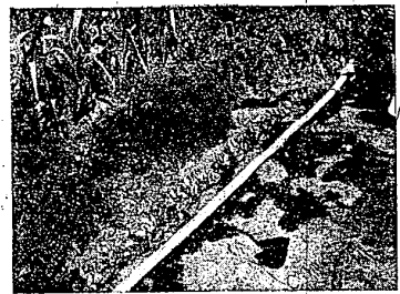
A Leaky Canvas Hose Serves as an Irrigation Ditch

If you have an elm tree which you believe to have Dutch Elm Disease, have it checked now. Take four or five branches from the tree which are about a half inch in diameter and cut them about seven inches long. Mail these branches to Michigan State College, Dutch Elm Laboratory, Botany Department, East Lansing, and have them checked. Make sure you have live branches. The disease is spread by the European bark beetle. A small pest, the beetle is brown or black in color and destroys by drilling holes in the bark of the elm tree. The female beetle is now laying next year's eggs.