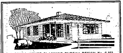
A SMALL HOUSE PLANNING BUREAU DESIGN No. C-352