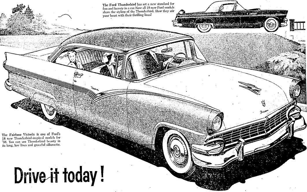
The Fairlane Victoria is one of Ford's 18 new Thunderbird-inspired models for '56. You can see Thunderbird beauty in its long, low lines and graceful silhouette.