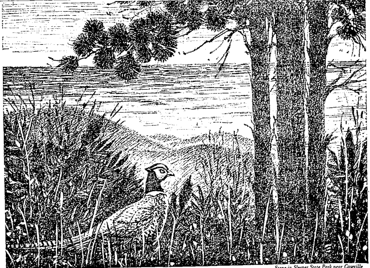
Scene in Steeper State Park near Cassville