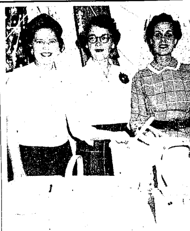
A BASKET TEA sponsored by the Trinity Episcopal Church in Adams Hall Thursday afternoon was a great success. Active in making arrangements for the affair were the ladies shown above, gathered around baskets which were offered for sale.