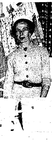
A BASKET TEA sponsored by the Trinity Episcopal Church in Adams Hall Thursday afternoon was a great success. Active in making arrangements for the affair were the ladies shown above, gathered around baskets which were offered for sale.

The couple celebrated with a wedding dinner at Rosemont Hills. At present the newlyweds are making their home at 5740 Penton.