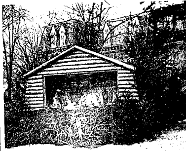
THE NATIVITY Scene was set up again this year on the Township Hall site at the corner of Grand River and Farmington Road as part of Yuletide decorations in the City of Farmington. The scene will remain up until after New Year's, providing an opportunity for all in the area to see it.