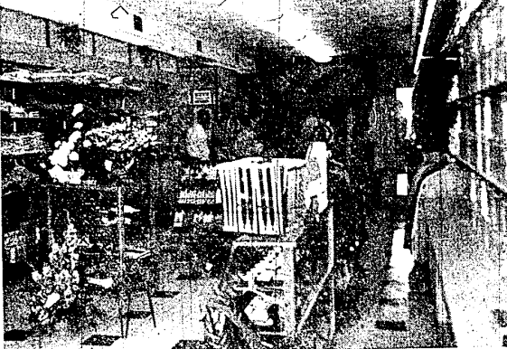
THE BEAUTIFUL interior and high quality merchandise displayed at the new Davis and Lent store for men and young men, which opened last week end at 3336 Grand River Avenue, was the center of attraction in the City of Farmington last week end. Nearly 4,500 persons browsed through the new store during the three-day grand opening celebration.