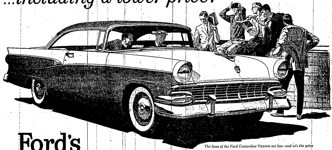
The lines of the Ford Customline Victoria are low—and so's the price

All you want in a hardtop ...including a lower price!