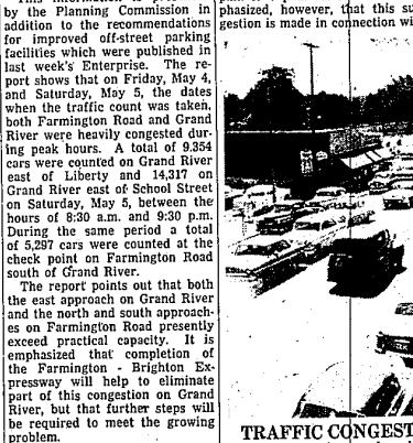
TRAFFIC CONGESTION in Farmington's central business area is a serious handicap to the present and future development of the shopping district, according to the recently completed Farmington Road study. The most critical area, Farmington Road from Grand River south to the Post Office, is pictured in this photo taken from the roof of The Enterprise building.

The recently completed Farmington Road study by the Oakland County Planning Commission, points out that traffic congestion during peak hours is having a serious effect on the Grand River south to the Post Office during the period from 4 p.m. to 6 p.m. It should be emphasized, however, that this suggestion is made in connection with