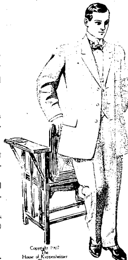
Copyright 1907 House of Representatives Chicago