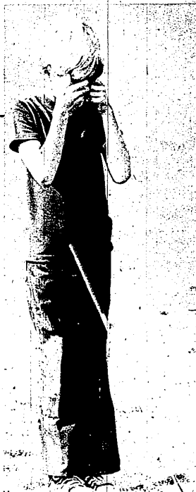
"I didn't make the cut?"