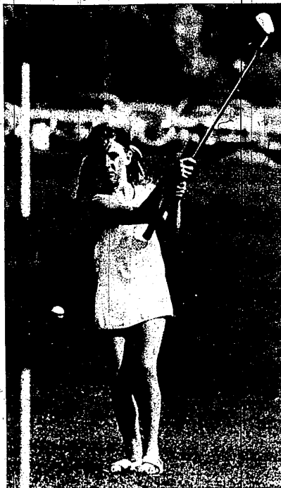
"Quick, somebody pull the pin!"