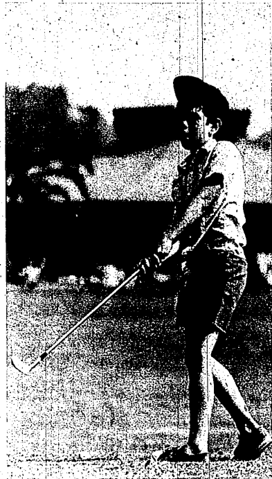
"Gee, I miss just like my dad."