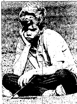
"I gave up bubble gum for this?"