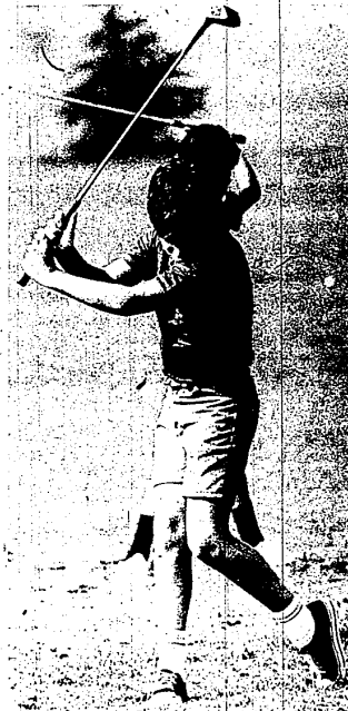
"Look out ant, I'm gonna getcha!"