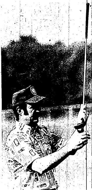
"If all else fails...."