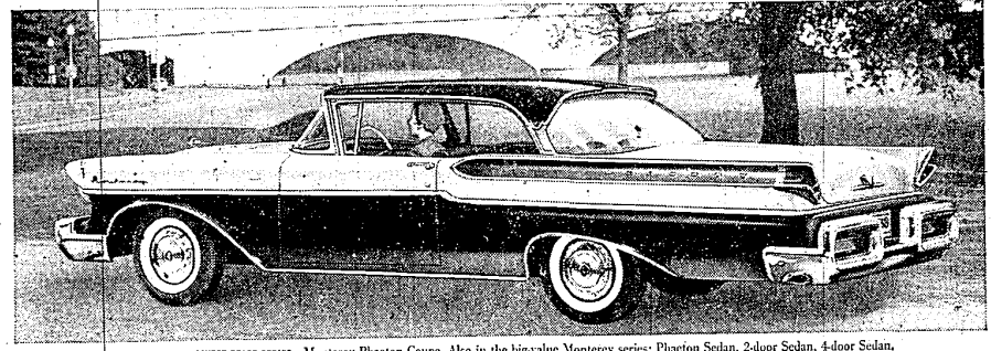
IN MERCURY'S LOWEST PRICE SERIES—Monterey Phaeton Coupe. Also in the big-value Monterey series: Phaeton Sedan, 2-door Sedan, 4-door Sedan.

Don't guess Mercury's price by the new size and luxury (never before has so much bigness and luxury cost so little)