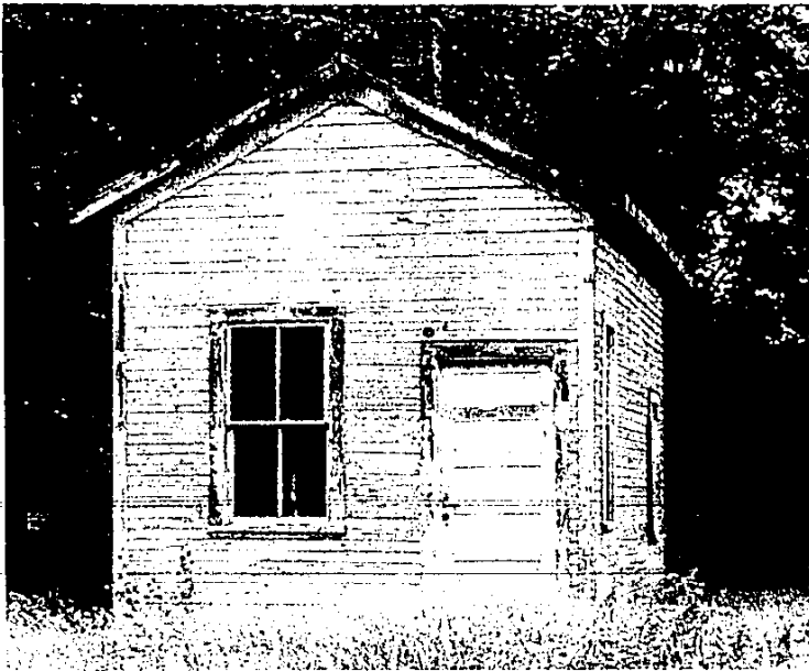
WITHERED AND WEATHERED is this former trolley car depot, on Ann Arbor Trail, west of Newburgh. Tall weeds and wild flowers obscure the building which lies in wait for the days when speedy mass transport may again come to Observerland.