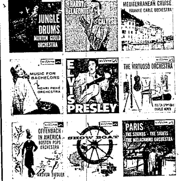
All albums feature the world's greatest artists and RCA Victor's brilliant "New Orthophonic" High Fidelity Sound. All albums available on Long Play or 45 EP.

THREE RCA VICTOR ALBUMS WORTH $11.94 FOR $3.98!