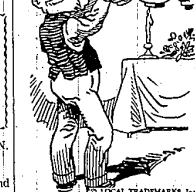
PLEASANT MEMORIES MUST BE ARRANGED FOR IN ADVANCE