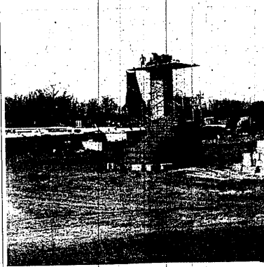
WORK ON the new elementary school on Shawnee Road east of Middlebelt Road at the old William Grace School site is being continued despite inclement weather and road restrictions halting the movement of large supply trucks to and from the site. Workmen are shown above completing the chimney unit, for the school. The building is scheduled to be completed and ready for occupancy by this September.

An explorer says an Eskimo woman is old at 40. An American woman is not so old at 40. In fact, she's not even 40!