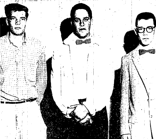
A FINE ARRAY of local talent was displayed at the talent show last Friday evening, given in conjunction with the Farmington Teen Topper teen club dance. A capacity attendance of teenagers viewed the talent show and enjoyed dancing to the music of the local "Swing King Dance Band" throughout the remainder of the evening. Three of the winners in the talent show