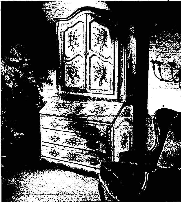
NEW OR OLD, it's often difficult to tell merely by looking. Anything over 100 years old may be considered a genuine antique.

Frequently available are pieces of furniture made out of inferior wood in which the finish is rubbing off. These can be purchased, usually at bargain prices and can easily be painted or antiqued to match a particular color scheme. Further embellishments to enhance such a Cinderella piece might include knobs or metal pulls, available in most hardware stores.