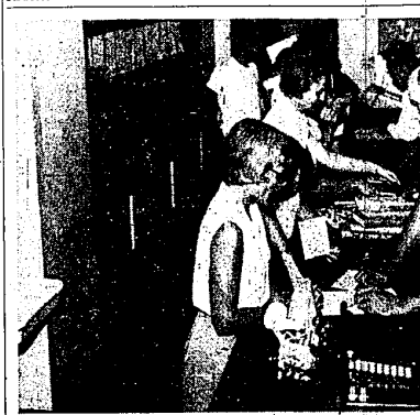
A BUSY spot for the last couple of weeks has been the School Book Store, located in the basement of the Farmington Junior High School. Long lines were regularly in evidence on the opening days of registration for junior and senior high students. Activities had slowed down considerably by Friday, when the above picture was taken, but there was still a steady flow of customers. Parents who have not already done so are urged to obtain books for their children immediately.

THE CITIZENS of the Farmington area are mapping plans for one last thing before summer passes from the scene. The coming Labor Day week-end marks the unusual close of the official summer season. However, this is not the purpose of this paragraph. It is rather a reminder to all of you that the City and Township offices will be closed from 5:00 p.m. Friday evening until Tuesday morning. The branch offices of the Secretary of State and the National Bank of Detroit will be closed on Saturday and Monday while the Farmington Post Office will be closed on Monday. Most stores and business places will also be closed on Monday. In order that employees may enjoy this last big holiday of the summer season.