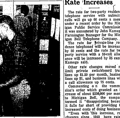
A BUSY spot for the last couple of weeks has been the School Book Store, located in the basement of the Farmington Junior High School. Long lines were regularly in evidence on the opening days of registration for junior and senior high students. Activities had slowed down considerably by Friday, when the above picture was taken, but there was still a steady flow of customers. Parents who have not already done so are urged to obtain books for their children immediately.