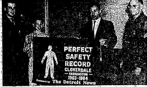
PERFECT SAFETY RECORD CLOVERDALE - FARMINGTON 1963-1964 The Detroit News