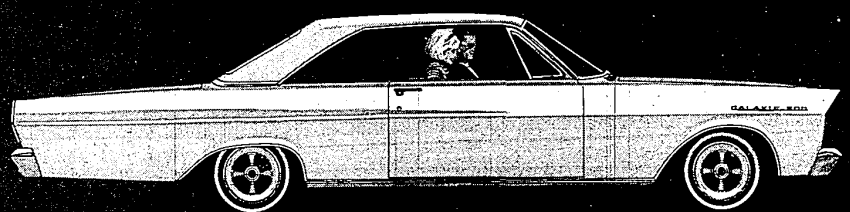
'65 Ford Galaxie 2-Door Hardtop

Test-drive Ford's new Six... more thrift, more thrust!