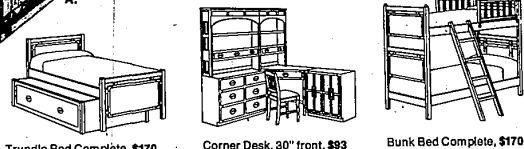
Trundle Bed Complete, $170