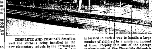
COMPLETE AND COMPACT describes well the kitchens being installed in the new elementary schools in the Farmington School District. Designed specifically for the school, low lunch program, everything is located in such a way to handle a large number of children in a minimum amount of time. Peeping into one of the storage compartments at the Cloverdale School is Principal John Klingebeger.