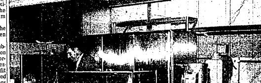
COMPLETE AND COMPACT describes well the kitchens being installed in the new elementary schools in the Farmington School District. Designed specifically for the school, low lunch program, everything is located in such a way to handle a large number of children in a minimum amount of time. Peeping into one of the storage compartments at the Cloverdale School is Principal John Klingebeger.