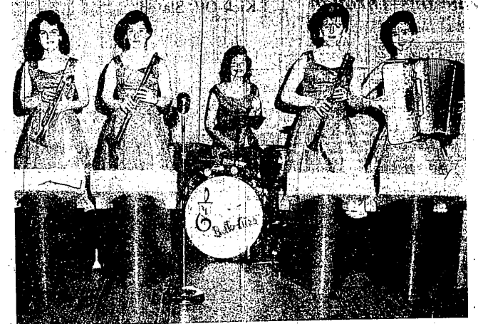
PROVIDING THE MUSIC for the forthcoming Belle Aire Ball to be held September 27 at Guffin's Frontier Town will be the professional Belle Aires All-Girl Orchestra. The young women making up the orchestra are...