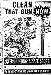
KEEP HUNTING A SAFE SPORT