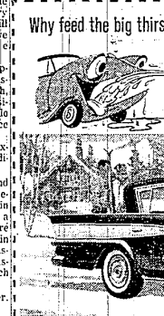
Now for '59, Rambler gives you more for your money — 25¢ to $214 on comparable 4-door turn and park... first with individual section sofa front