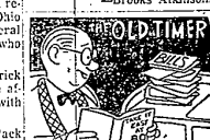
"Lots of books tell you how to manage after you retire. What's wanted is one that'll tell you how to manage until!"

Real art is illumination... It adds stature to life. —Brooks Atkinson.