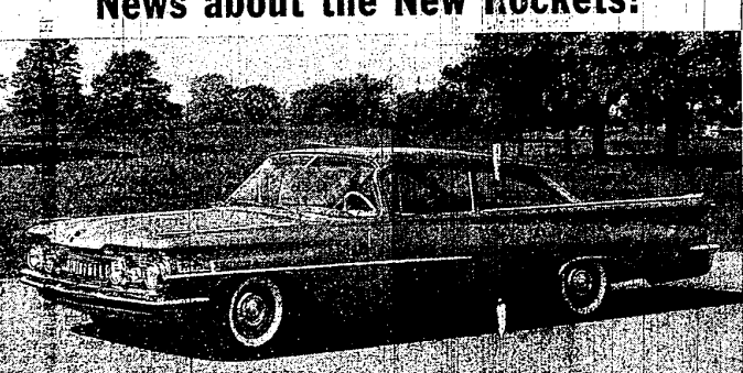
1959 OLDSMOBILE DYNAMIC 88 2-DOOR SEDAN—Here is Oldsmobile's breath-taking "Luster Look" beauty at its lowest price. The Dynamic 88 2-Door Sedan puts big-car comfort and new "Glide" Ride within easy reach of cost-conscious buyers. Best news of all: its spirited Rocket

P. S.: An additional thank you to those people who gave so generously of their time and effort on our behalf.