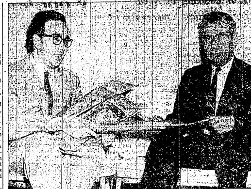
TAKING AN ACTIVE part in the Farmington Goodfellow effort to see that every needy child in the community has a merry Christmas, the Farmington Lions Club is contributing 100 Christmas stockings filled with toys and candies for distribution by the Goodfellow.