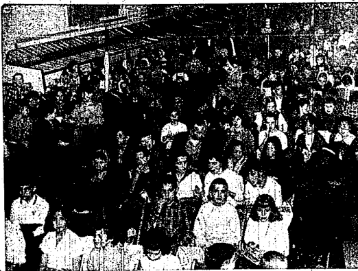
MOVIE SHOWS were enjoyed by approximately 600 youngsters in a special roped off area of the new Food Fair Market in the Kendallwood Center at 12 Mile and Farmington Road last Saturday. Complimentary tickets were given youngsters in the area of the market that they might enjoy the open house at the store on Saturday with their parents. Shown here is a

portion of the 300 youngsters who gathered for the first showing of 2 1/2 hours of movies by the Food Fair management. The same number enjoyed an afternoon program of movies. This, the second Food Fair Market to be opened in Farmington, officially opened its doors for business Wednesday morning, January 13.