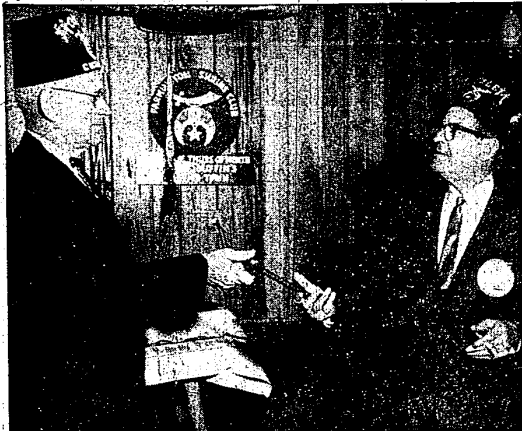
OFFICIALLY taking over the gavel as new president of the Farmington Shrine Club for 1960 during ceremony last Thursday evening at Guffin's Frontier Town was