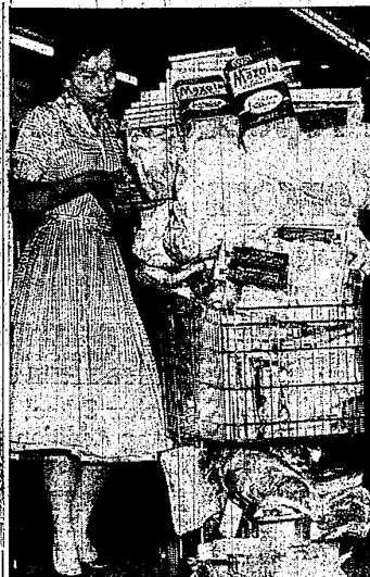
THE A & P "FOOD SCRAMBLE" netted $711.69 for Maria Corona as she called it quits after 14 of the 15 minutes allotted for the race. There just wasn't any more room.

Couples standing in place are to wear a matching piece of clothing to that of their date.