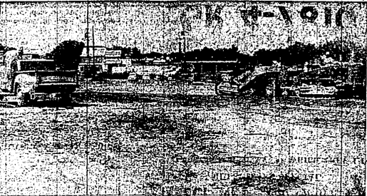
EARTH MOVING and grading operations were in full swing last week in the section of Downtown Farmington designated as Parking Area "A." This picture was shot from the corner of Farmington Road and Orchard Street. The rear of the business places on the south side of Grand River east of Farmington Road can be seen in the background.

LEGAL NOTICE NOTICE OF REDEMPTION School District No. 5, Fractional of the Townships of Farmington, Livonia, and Redford, Oakland and Wayne Counties, Michigan (Now named Clarenceville School District of Oakland and Wayne Counties, Michigan) School Building and Site Bonds NOTICE is hereby given that the above named School District hereby calls for redemption the following described bonds on September 1, 1960, at par and accrued interest to September 1, 1960, plus a premium of $25.00 per bond to wit: School Building and Site Bonds dated September 1, 1954, numbered 276 through 280, due September 1, 1958, aggregating a principal sum of $5,000.00, and bonds numbered 281 through 278, due September 1, 1957, aggregating a principal sum of $15,000.00. The said bonds shall be delivered to the City Bank, Detroit, Michigan, for payment on September 1, 1960, after which all interest on said bonds shall cease. THOMAS C. WILSON Secretary Board of Education July 21