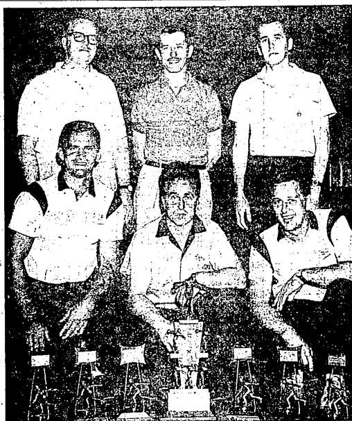
THE CHAMPIONSHIP bowling team in the Bel-Aire House League this year is shown above with their trophies at a post-season banquet held recently in Farmington. $1,000 in prize money went along