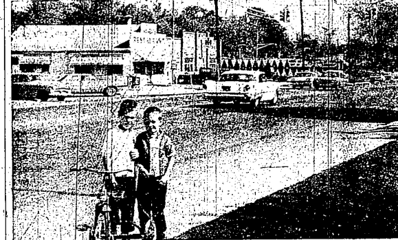
THE NEWLY INSTALLED traffic light at the intersection of Orchard Lake Road and Grand River near the east City limits of Farmington came as a mildly pleasant surprise to motorists familiar with the location. The Oakland County Road Commission erected the stop and go signal last week and now drivers can negotiate turns at the intersection with a great deal more ease than was possible before.