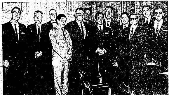
THE NEWLY COMPLETED Municipal Building in Farmington got an inspection on Monday of this week from distinguished visitors from Cali, Columbia, and their Oakland County and local government officials.

Action recommending approval by the Township Board on two rezoning requests was called for by the Zoning Board at its regular meeting last Thursday night after the holding of official public hearings on each. The decision was to delay making any recommendation on a third request until the next regular Zoning Board meeting on Oct. 24. The request given the Zoning Board's nod of approval involving the largest piece of land was for rezoning from one family residential to multiple dwellings of a 20.6-acre parcel at the northwest corner of Nine Mile and Gill roads. Owners of this property propose to construct an 80-unit garden type apartment complex here. At the public hearing there were no objections voiced to this rezoning although citizens did raise a couple of questions regarding the plan. The Board also recommended approval on rezoning of a 1.43-acre parcel at the northeast corner of Nine Mile and Middlebelt roads from single family residential to commercial. Two residents in the area voiced objections to this rezoning. The rezoning request which action was delayed on has to do with a request for enlargement of the commercial property at the northwest corner of 12 Mile and Halsted roads. It was indicated that the proposed use of the property would be for a gas station if the enlargement were granted and members of the Zoning Board questioned the need for a gas station at this location.