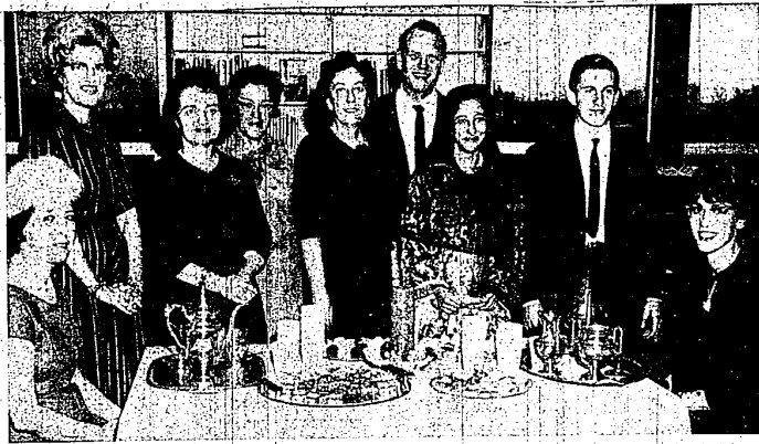
THE AMERICAN FIELD SERVICE Chapters in Farmington combined to present a tea last Thursday, November 21, at North Farmington High School...