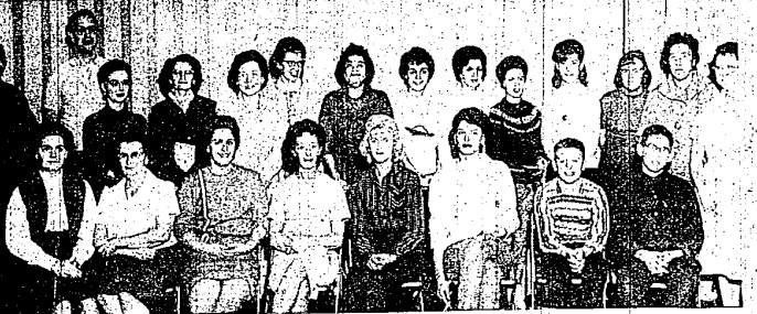
CIVIL DEFENSE Course graduates in Farmington Township got together for the group picture above last week after having completed their study of vital survival procedures and emergency measures which would be necessary in the event of a nuclear attack.

The North Suburban League opener for both squads, NFHS opened Oak Park, 59-46 in a game comely dominated by the Raiders. NFHS led at the quarter 20-8; at the half 35-17; and by the end of the third quarter had built the lead up to 51-31.