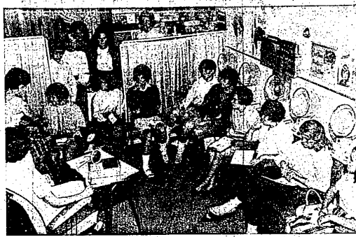
THE TEENAGE GIRLS pictured above are giving rapid attention to their instructor during a session of a Charm, Poise and Culture course currently underway at the