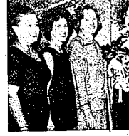
Don Sherman Hubert Auxiliary Report