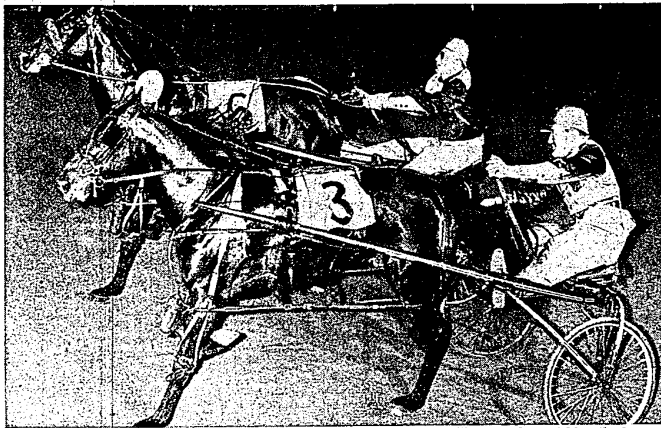
THEY'RE OFF. The familiar cry of the pacers and trotters leaving the post will resound through the stands at Northville Downs Friday night when the state's earliest parimutuel betting meeting opens. And

this scene is a familiar one also, catching the horses at the finish line. The standardbreds will perform nightly at the 'Downs for 18 nights.