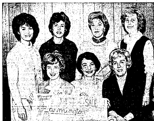
FARMINGTON ARTISTS are making final arrangements for their first Art Exhibit and sale, Sunday, April 25 from noon til 7 p.m. at the Hobby Shop, 23342 Farmington Road, Farmington. The show and sale will consist of oils, watercolors, in landscapes, seascapes, still-

KE 7-7720 25742 GRAND RIVER at Beech Daly