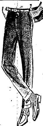
Sears Men's Working Clothing Dept.

Extra Slims: dropped L shaped slanted front pockets, set-in back pockets. Cuffless, bellless "skinny" model. 14" bottoms.