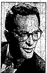
ROBERT Q. LEWIS