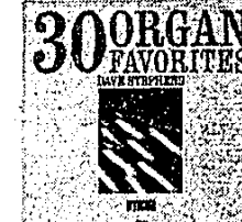
30 ORGAN FAVORITES: La Paloma, Meet Me in St. Louis.