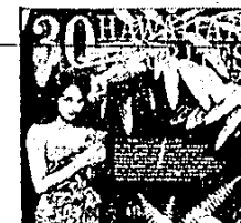
30 HAWAIIAN FAVORITES: Island Serenade, many others.