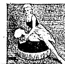
MANCINI FAVORITES #1: Moon River, Chorus, many others.