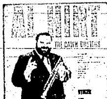
AL HIRT: Gotta Go, Mama Terra-bonne, Pitter Patter, others.