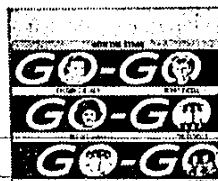
DANCE-A-GO-GO: Chubby Checker, Davells, B. Rydell, others.