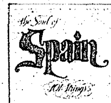
SOUL OF SPAIN: 101 strings, Malagueña, Espana, many others.