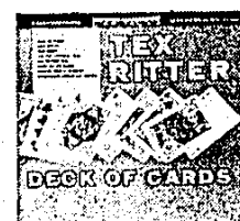
DECK OF CARDS: Billy the Kid and other greats by Tex Ritter.