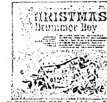
DRUMMER BOY: Rudolph the Red Nosed Reindeer and many more.