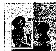
SARAH VAUGHAN - GEORGE SHEARING: Perdido, I'll Be Around, others.