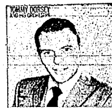
FRANK SINATRA: Without a Song, I'll Buy That Dream, etc.