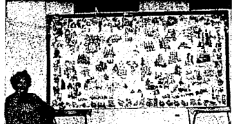
LENA STABLER sits next to her 8-foot x 4-foot Christmas card which took her 20 years to complete. This card she calls "Holiday Scene." It is composed of cards she has received. She has cut them out and made a gay, festive scene which sparkles with bells, wreaths, reindeer, mistletoe, Santas, everything that goes into making a Merry Christmas.

Two gigantic white cardboard Christmas cards are on opposite walls. They are surely the largest there are—8 ft. by 4 ft. to be exact. One is named "Christmas Villages" and contains replicas of every type and size of village surrounded by woods and by clusters of trees. Some jeweled, some carved. The other card is named "Christmas Holidays" and bells, garlands, Santas, sleighs, and reindeer leap across the surface in gay profusion.