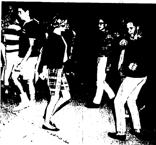
THE YMCA TEEN DANCES have moved to a new add larger location, the tennis courts in the Farmington City Park, and the response to the move was evident last Tuesday night, July 20, as enthusiastic teens crowded the scene. The dances had been held at the

A NUMBER OF good friendships have developed through these classes and some of the girls have even formed their own foursomes and play golf regularly. Quite frequently, four or five friends or neighbors have gotten together and make up their own class, and occasionally the husbands also