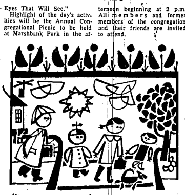
"LITTLE PEOPLE ON THE MOVE"