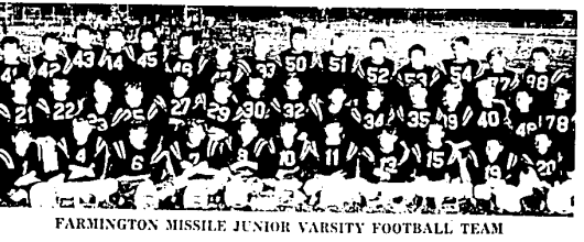
FARMINGTON MISSILE JUNIOR VARSITY FOOTBALL TEAM