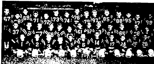
FARMINGTON MISSILE VARSITY FOOTBALL TEAM