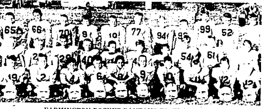
FARMINGTON ROCKET BANTAMS FOOTBALL TEAM