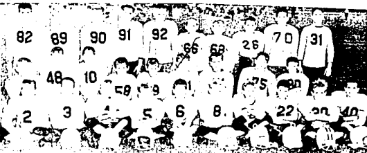
FARMINGTON ROCKET JUNIOR VARSITY FOOTBALL TEAM