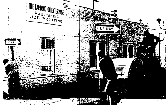
"WATCH OUT FOR MY TOES," seems to be the plight of the man above pictured clinging to the highway street sign in the alley leading to the City's newly paved parking lot in the southwest quadrant of the downtown business section. It isn't quite that way, however, as the man was part of the work crew doing the asphalt paving job and the man on the steam roller proved to be a pretty fair operator.