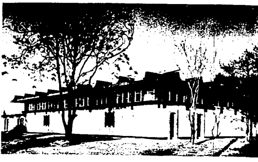
THE NEW EDUCATIONAL UNIT pictured above is the first of two buildings planned by the Clarenceville Methodist Church. Located at 20300 Middlebelt Road, the building will be consecrated at special services this coming Sunday.