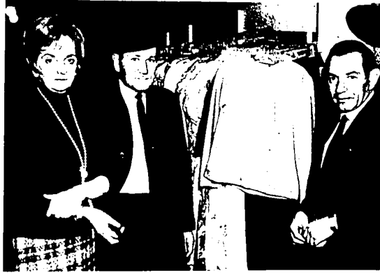
THE ANNUAL "MEN'S NIGHT" at Harv's Suburban Casuals was a big success this year as Christmas shopping for wives and sweethearts was made easy and enjoyable in an atmosphere of relaxation. A courteous staff helped the men in making their gift selections. Pictured above receiving