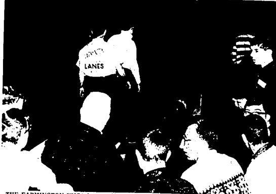
THE FARMINGTON YMCA has provided a social outlet for handicapped and retarded young adults who are unable to participate in regularly scheduled classes and programs. The group, called "Guys and Dolls", meets on Monday evenings for bowling and other organized activities. Some of the group is pictured above getting bowling instruction at Farmington Lanes. For information on how to join "Guys and Dolls" call the Farmington YMCA at 474-3232.